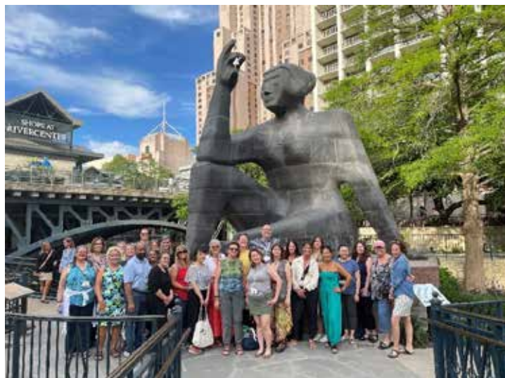
Michigan Gathering at the Stargazer Sculpture

As always, the chosen city had much to offer including a Riverwalk filled with art/sculpture and unique culture. The architecture was incredible and the Western art stunning. I have not been to a convention yet that has not had much to offer for all the senses. Consider joining your fellow colleagues at a NAEA convention in the future. Upcoming events include: Minneapolis 2024 – Louisville 2025 – Chicago 2026 – and NYC 2027. As you move forward into summer, look for PD opportunities that feed your soul. Plan for the upcoming conference in Ann Arbor this fall and continue to advocate in the best of ways for your students.